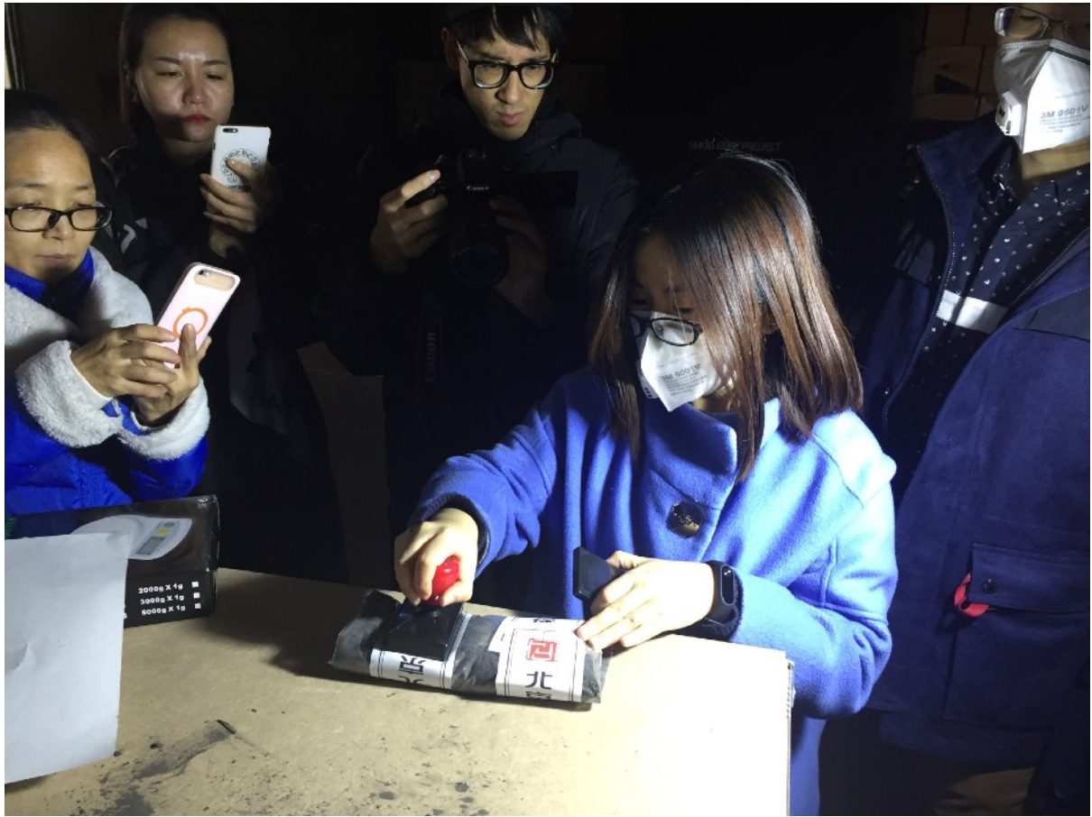
Official smog collection of Smog Free Tower - credits Studio Roosegarde