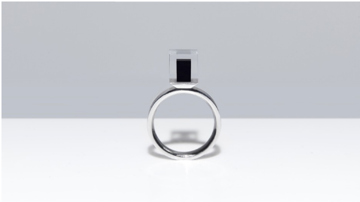
Smog Free Ring Beijing